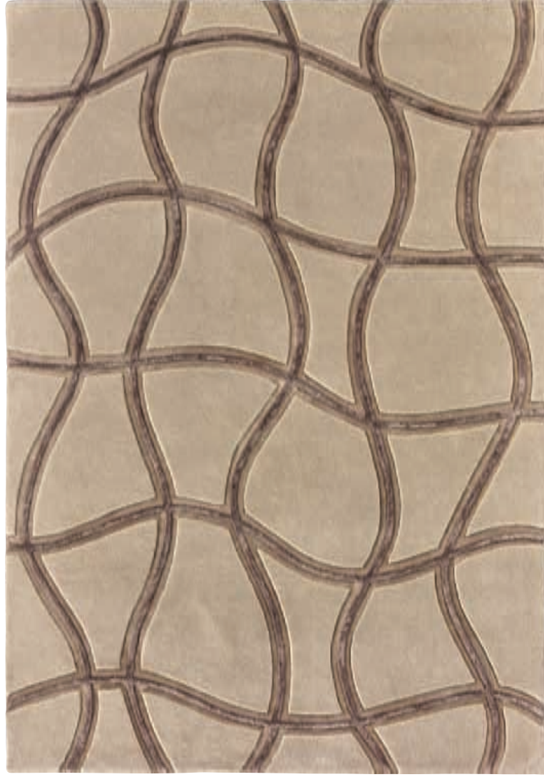
curves / wenge, Wool - leather