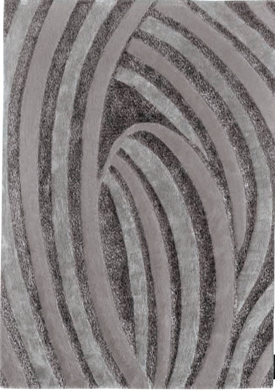
vertigo / silver, Wool - viscose