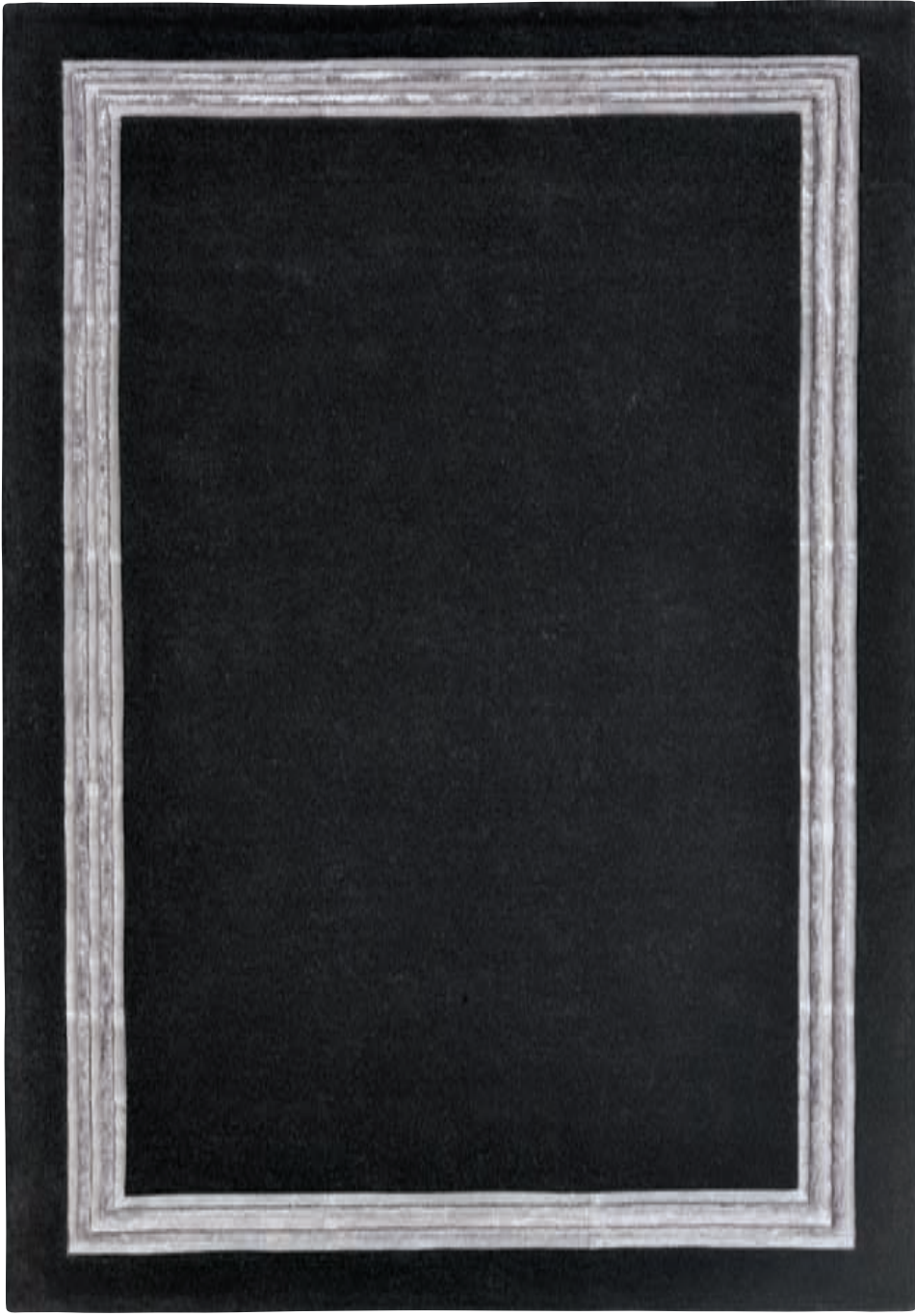
patch / grey black, Wool - leather